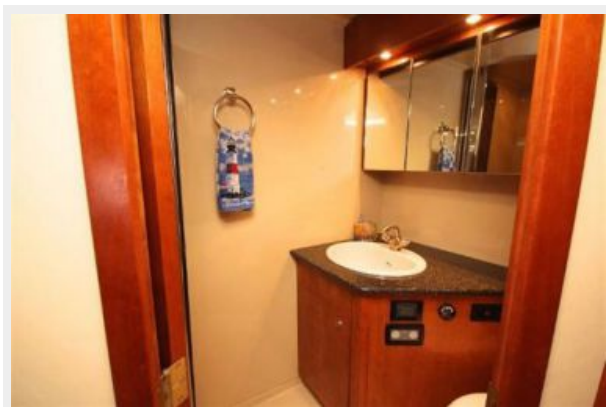
Master Head Vanity