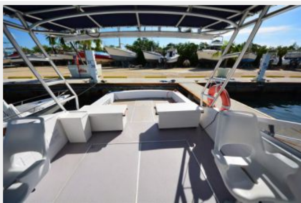
Helm looking aft