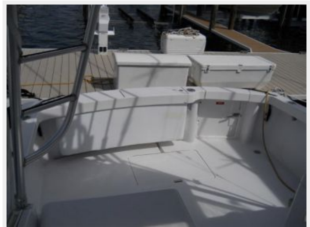
Insulated Fish Box