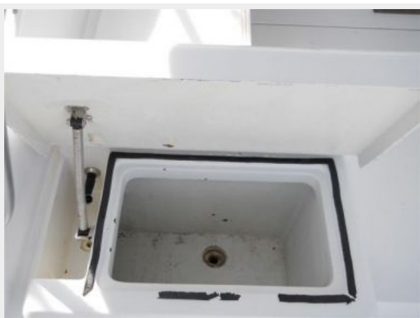
Insulated Drink Box/Fresh Water Rinse