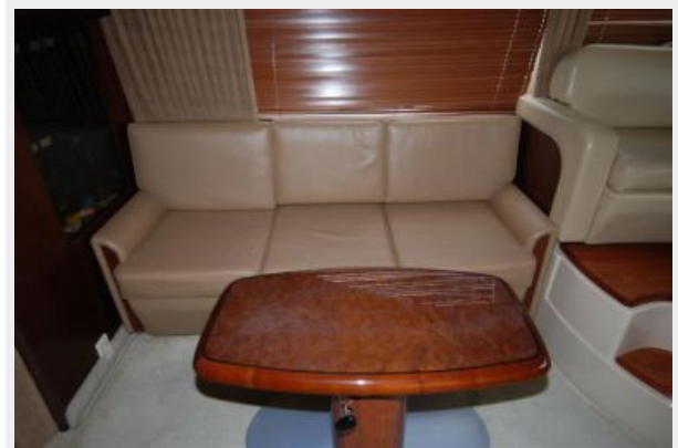
Port side couch