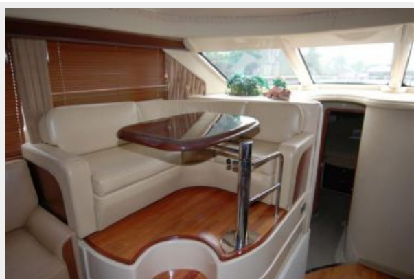
Salon Dinette w swivel table