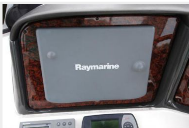
C-120 Color Plotter