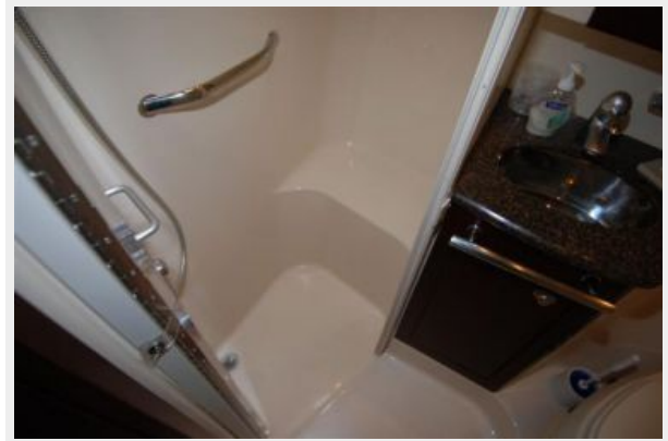
2nd Stateroom shower