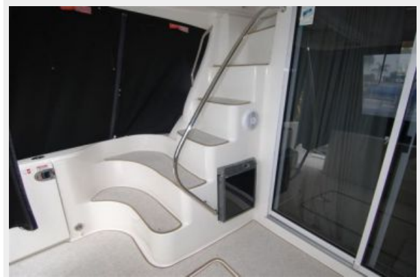
Molded steps to Bridge