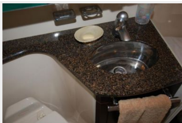
Sink in Master