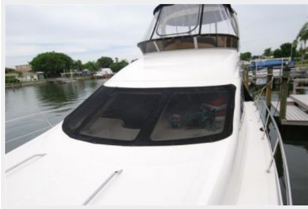
Another shot of Sliders