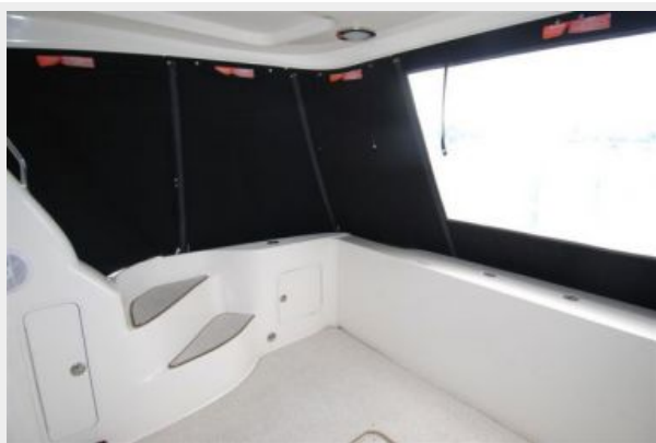
Enclosure and Steps to Starboard side