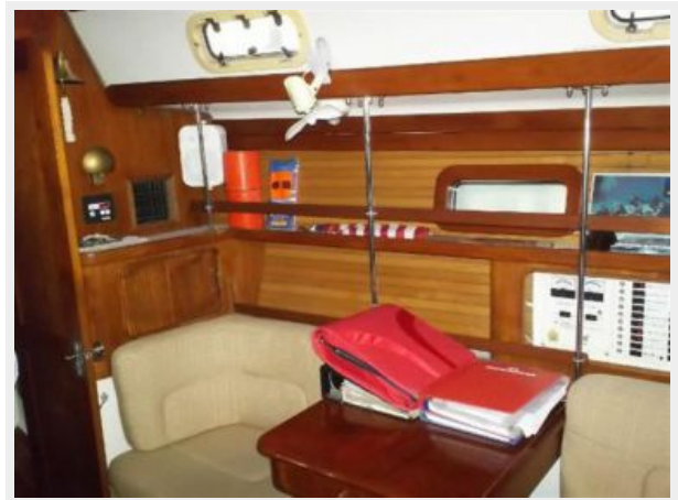
Salon Starboard View