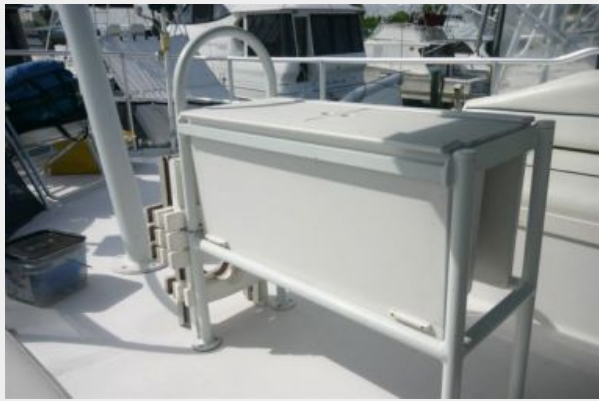
Flybridge Table Down