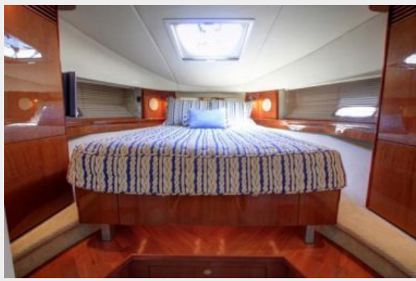
Forward Stateroom Forward