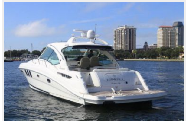
Port Aft Profile