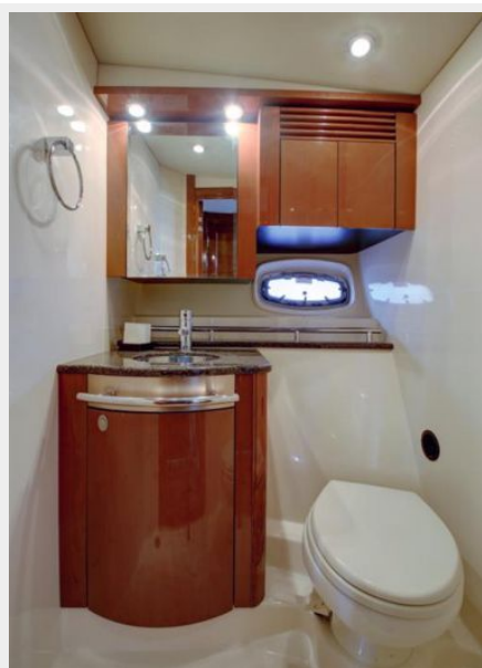
Forward Stateroom Head