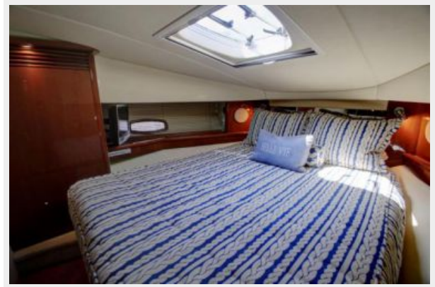
Forward Stateroom To Port