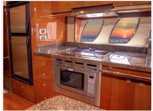
Galley Stainless Steel Stove & Refrigerator