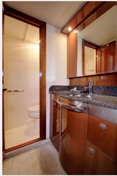
Port Stateroom Head