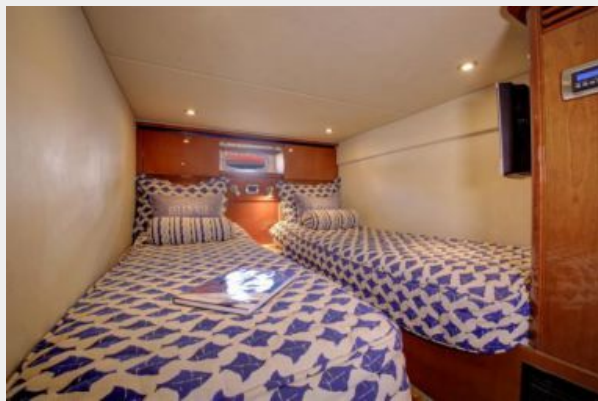
Port Stateroom (1)