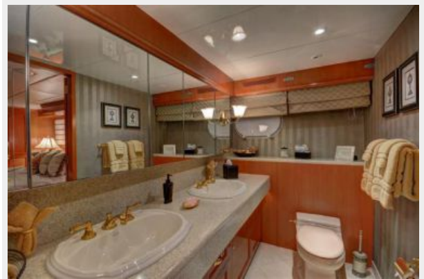
VIP Guest Bath