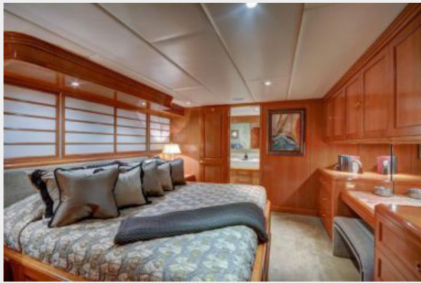
VIP King Guest Stateroom, Port