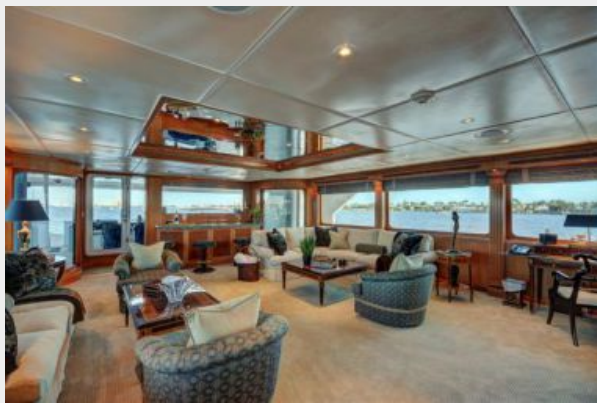
Main Salon, Aft