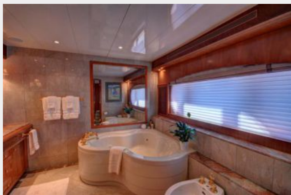
"Her" Master Bath