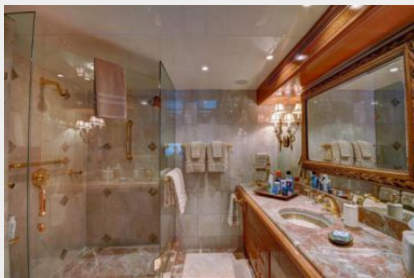
"His" Master Bath