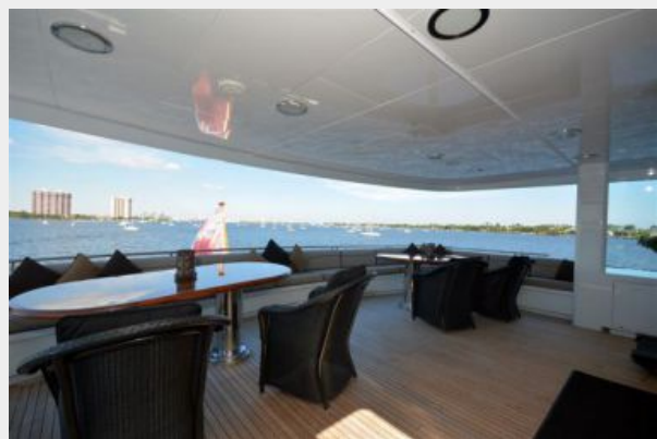
Upper Aft Deck