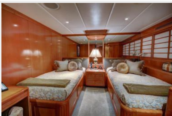
Twin Guest Stateroom, Port