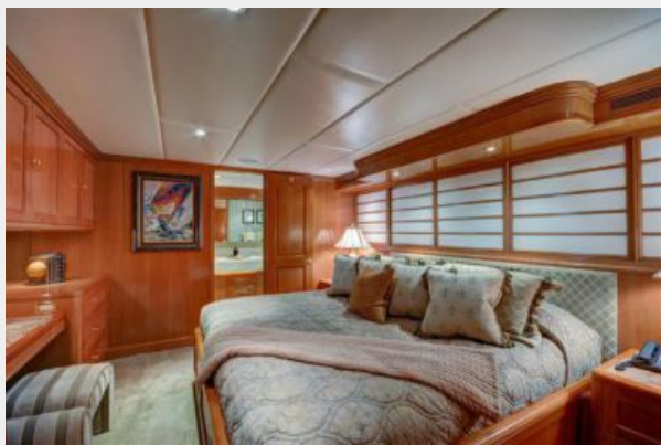
VIP King Guest Stateroom, Stbd