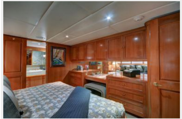
VIP King Stateroom