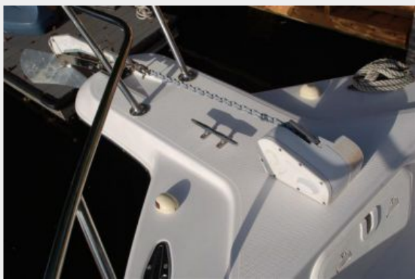
Pulpit and Windlass