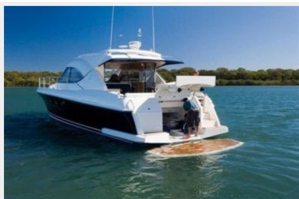
Swimming Platform Down