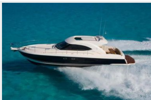
Manufacturer Provided Image: 4700 Sport Yacht