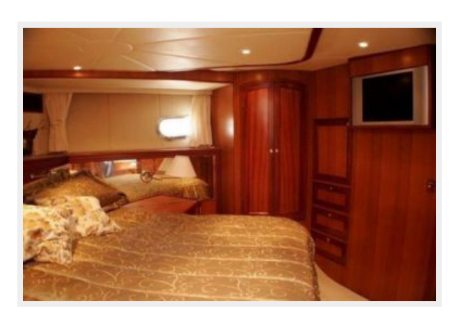
VIP Stateroom - Forward