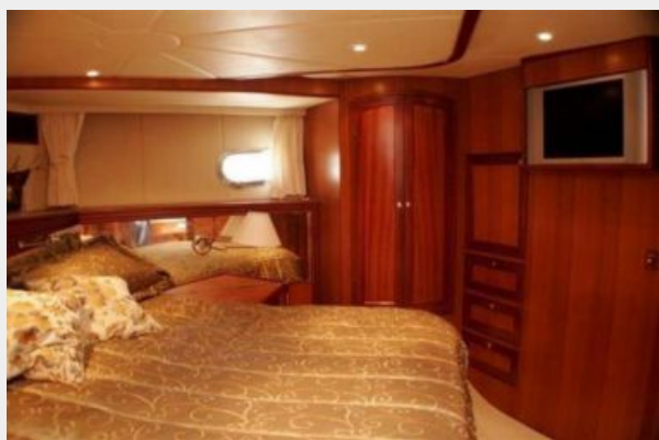
VIP Stateroom - Forward