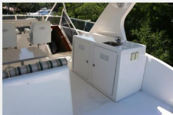
Flybridge Wet Bar