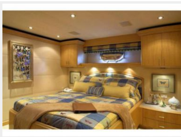
Guest Stateroom - Queen