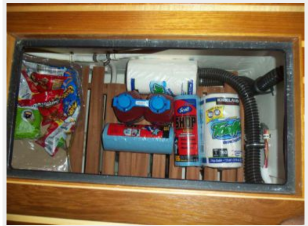
Storage Below Master Sole