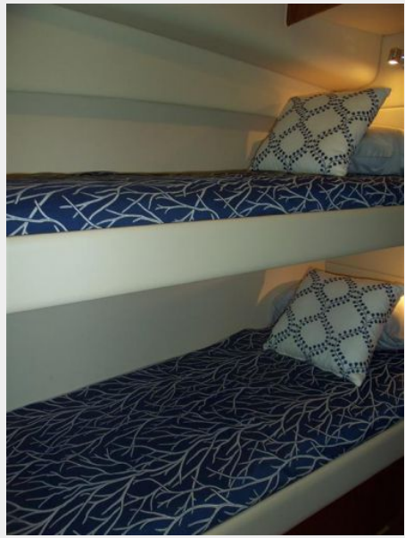
Starboard Cabin Looking Aft