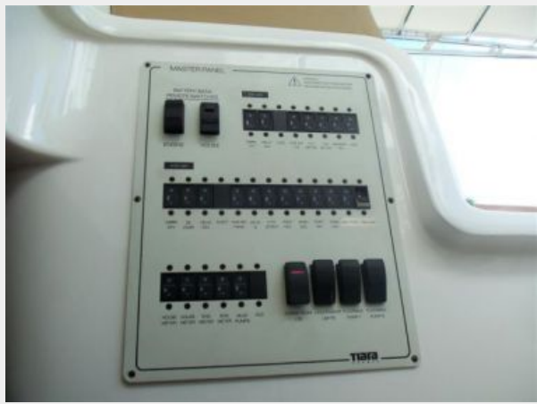
Engine Room Panel