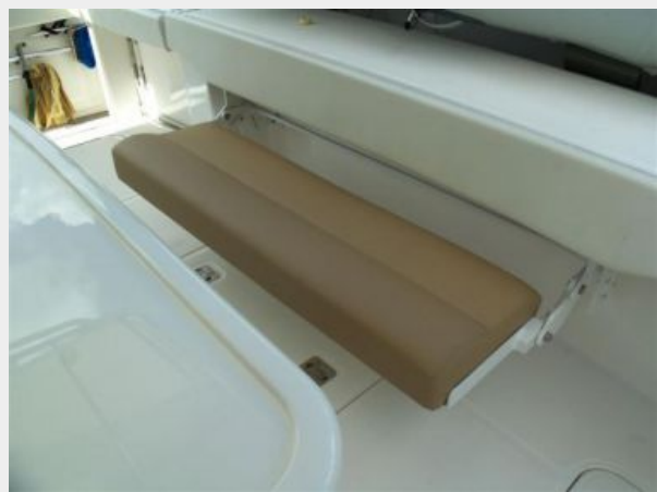
Fold Down Transom Seat