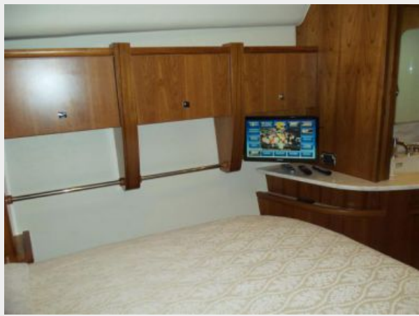
Master Looking to Port