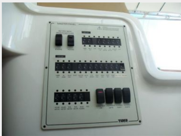
Engine Room Panel