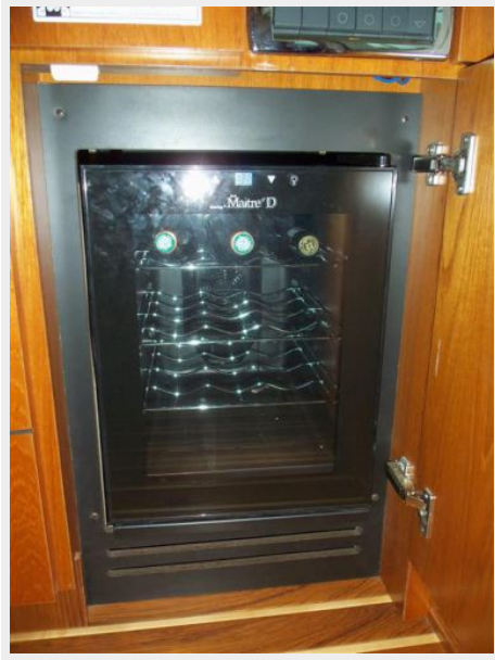
Salon Wine Cooler