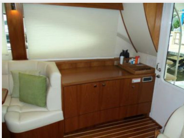
Salon to Starboard