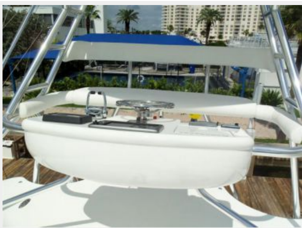
Custom Instrument Pod