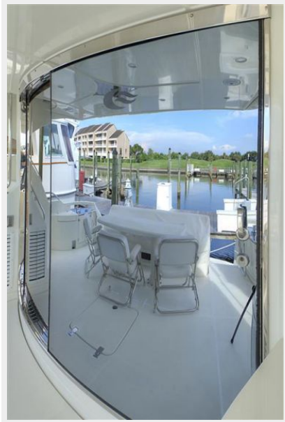
Salon entry door closed