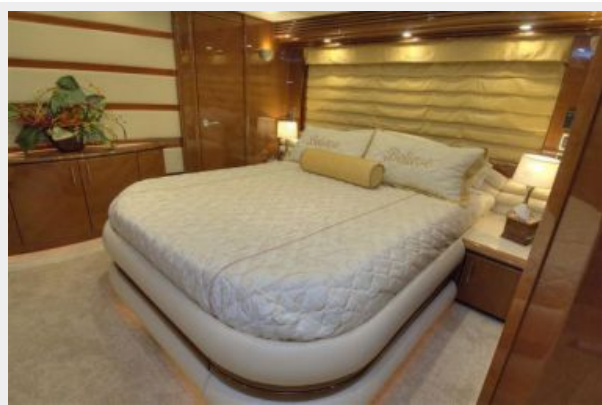
Master SR berth