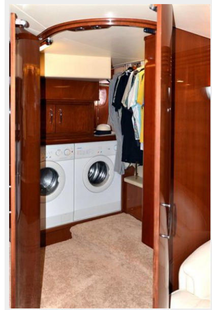
Master stateroom with portside head