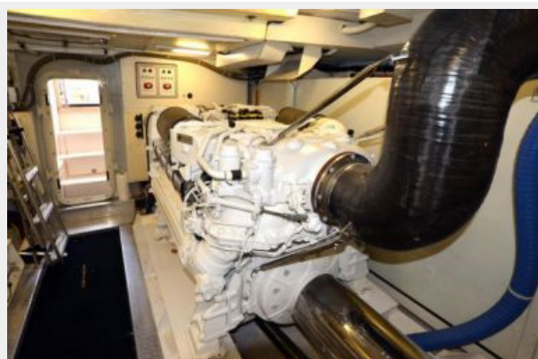
Port engine looking aft