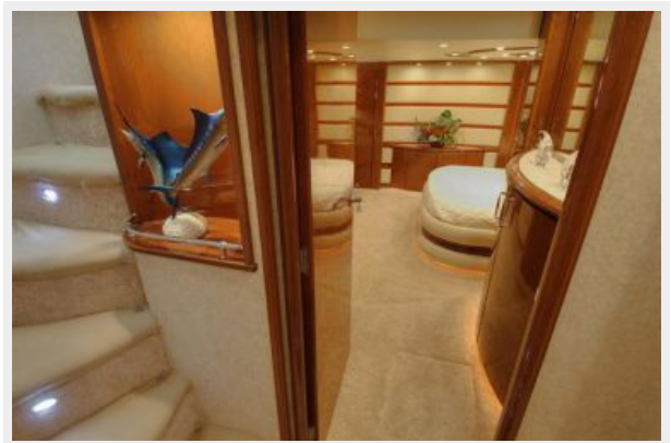
Master SR entrance