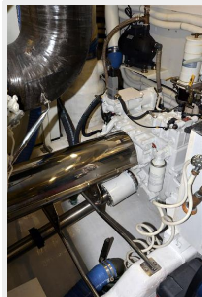
Transmission Port Engine