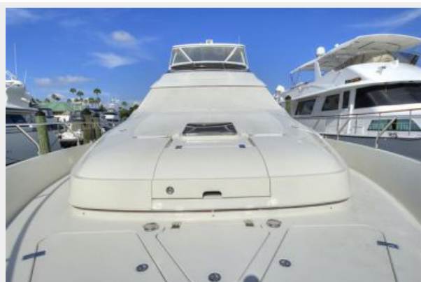
Bow view facing aft