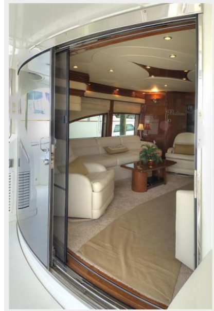
Salon entry door open