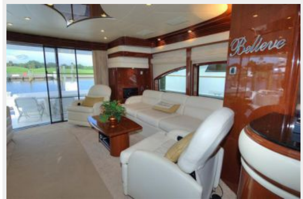
Salon port side facing aft