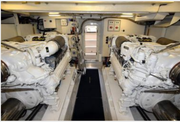
Engine room looking aft