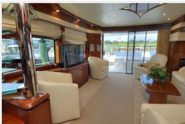
Salon strb side facing aft