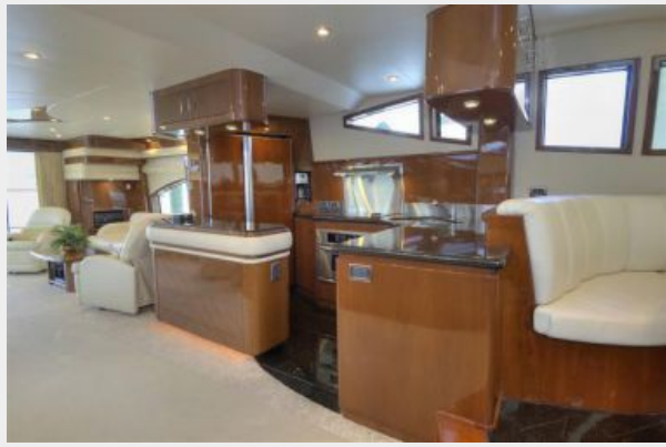
Galley and lounge area facing aft