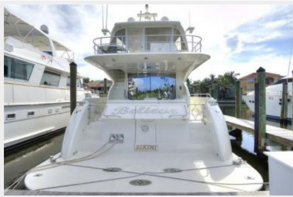
Stern view at dock