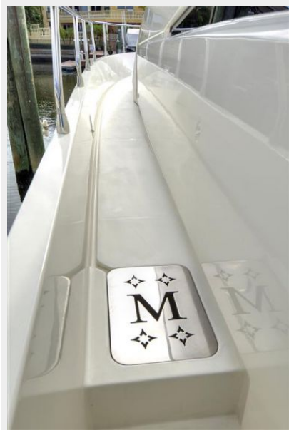
Port side deck looking forward