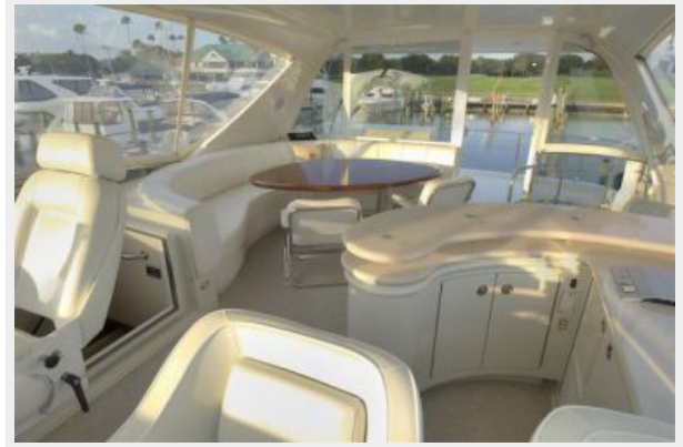
Bridge deck facing aft