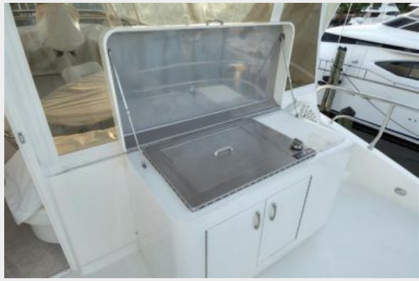
Aft bridge deck propane grill