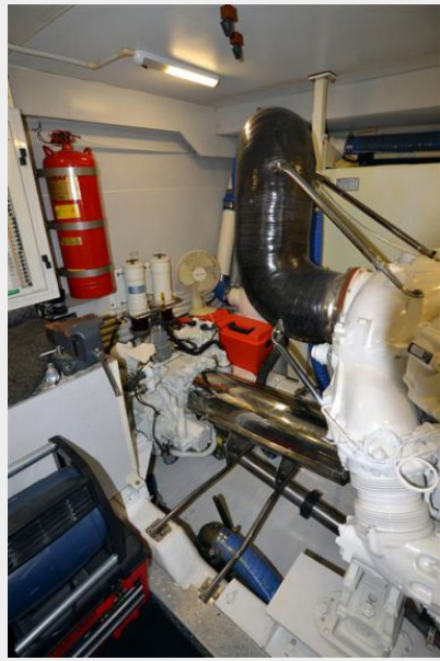
Forward of strb engine