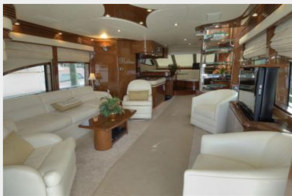
Salon facing forward