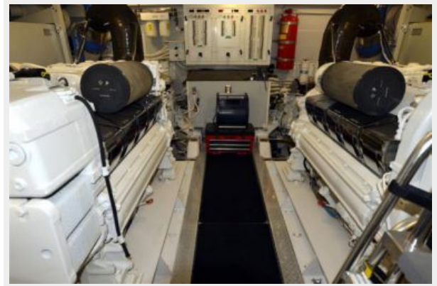
Engine room looking forward(2)