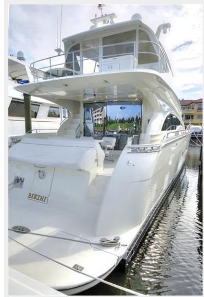
Stern view at dock (2)