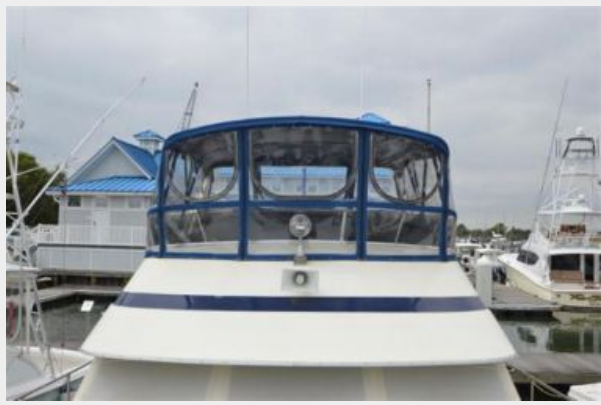
Enclosure with Spotlight