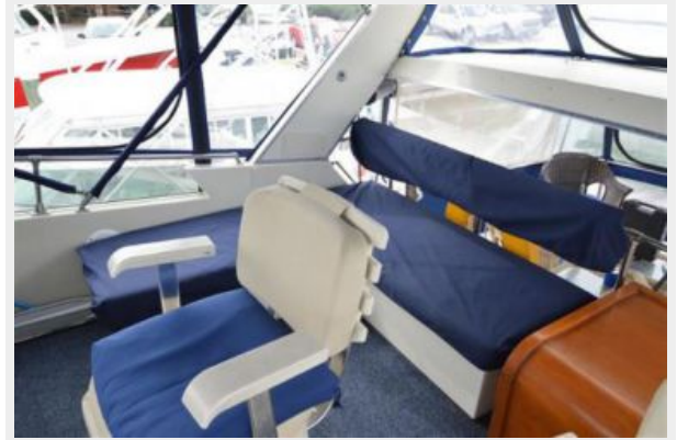
Seating with Canvas