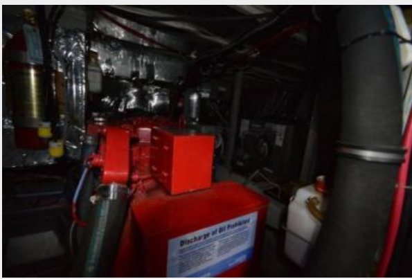
Engine Room Genset Location