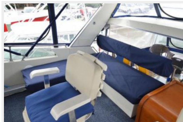
Seating with Canvas