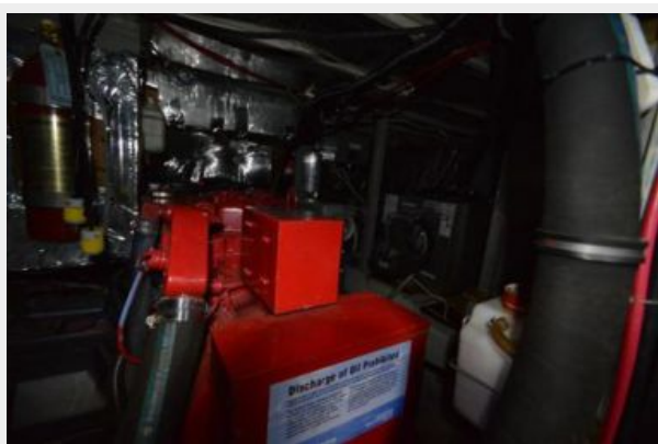
Engine Room Genset Location