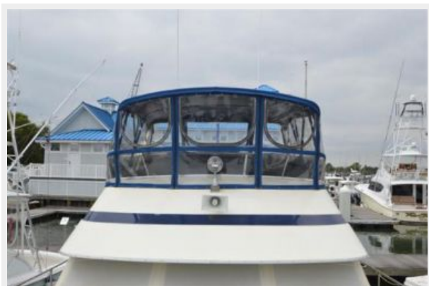
Enclosure with Spotlight