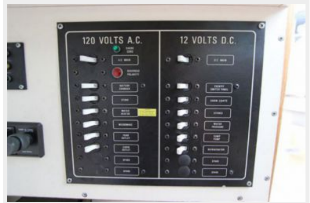
Pro-Mariner 60 Amp Battery Charger