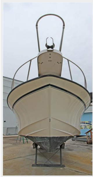
High Bow W/Lots of Flare For A Dry Ride