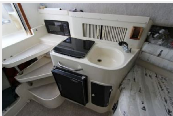
Galley W/Sink, Microwave, Stove, & Fridge