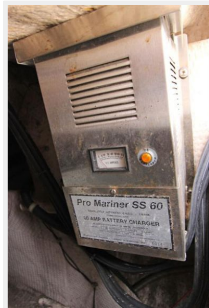
Pro-Mariner 60 Amp Battery Charger