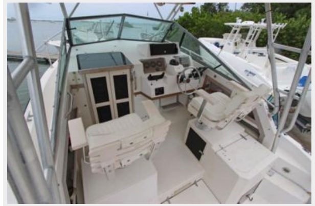
Raised Bridge W/Dual Captains Chairs