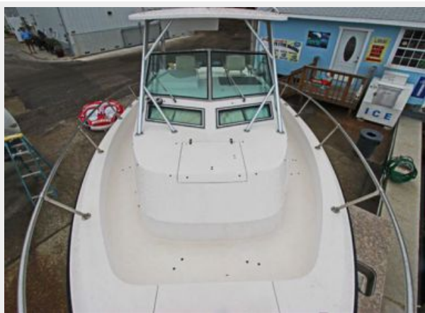
Bow View Looking Aft