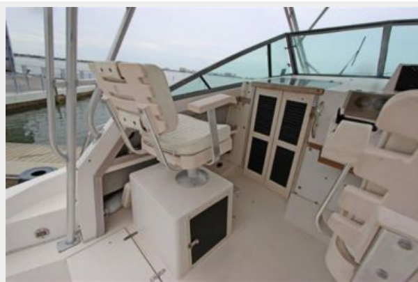
Port Bridge Seating