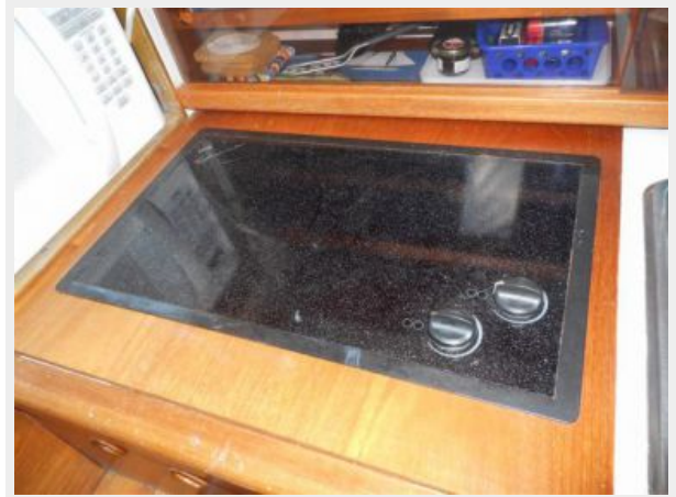
31' Fjord galley cooktop