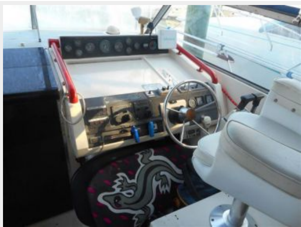
31' Fjord helm photo1