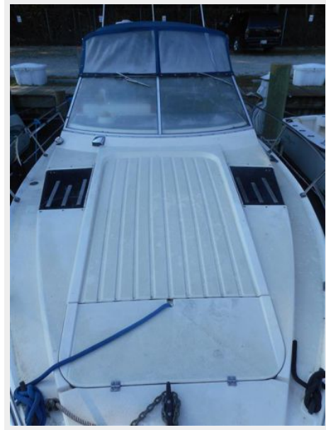
31' Fjord foredeck aft