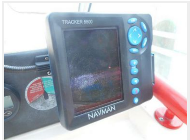
31' Fjord electronics