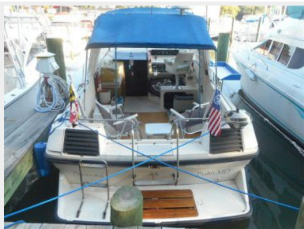
31' Fjord aft profile