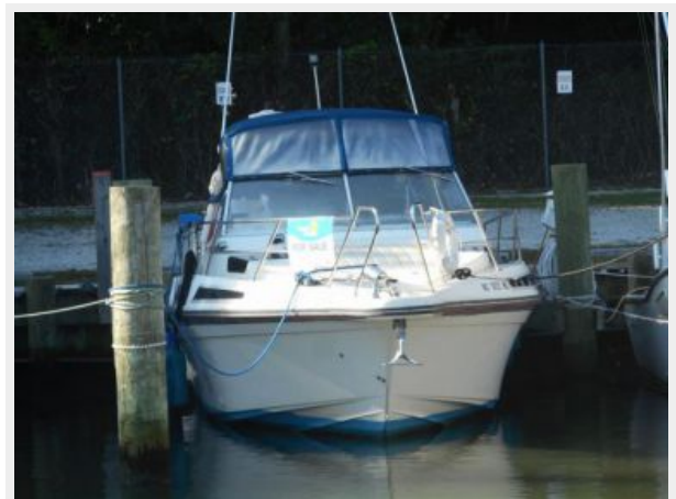
31' Fjord forward profile