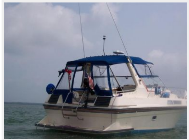
31' Fjord starboard aft profile photo1