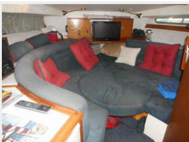
31' Fjord interior photo1