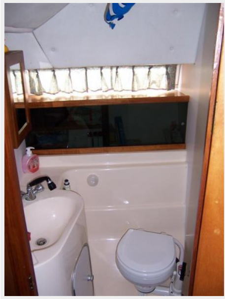
31' Fjord head