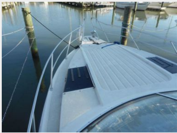
31' Fjord foredeck