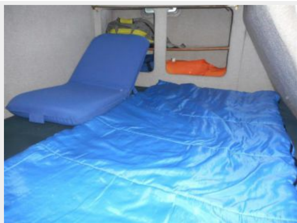
31' Fjord stateroom photo1