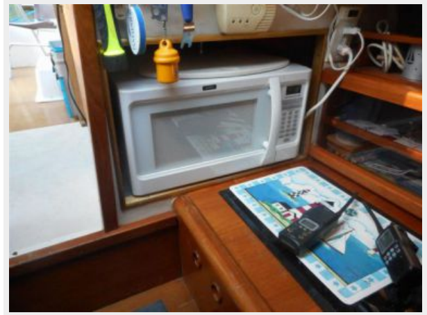
31' Fjord galley photo2