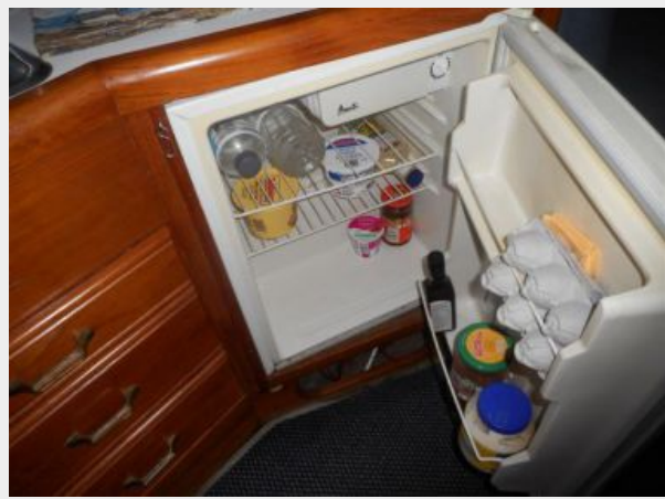
31' Fjord refrigerator