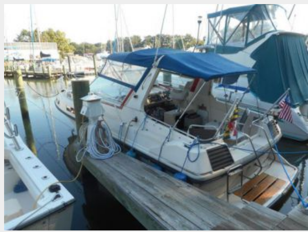
31' Fjord port aft profile