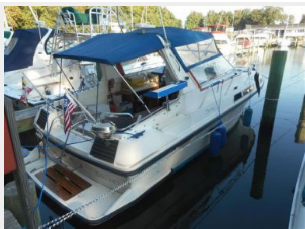
31' Fjord starboard aft profile photo2