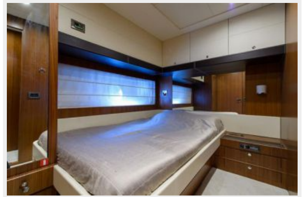
Starboard Side Stateroom