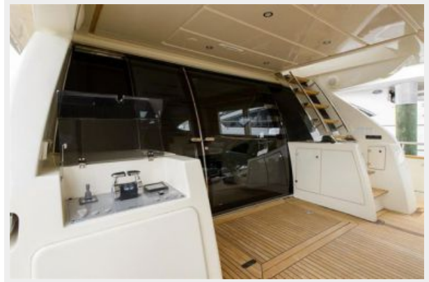
Aft Deck Controls