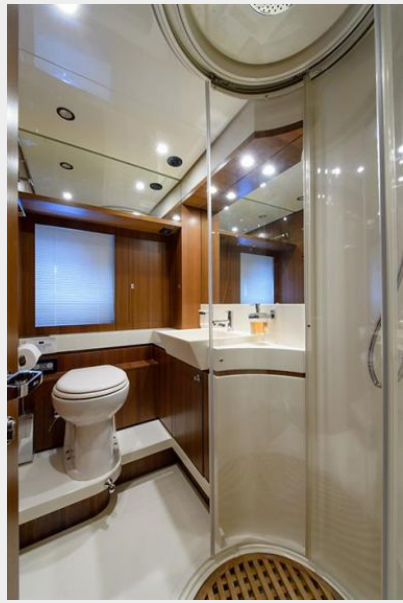
Port Side Head