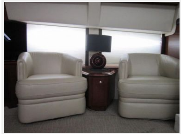
Salon Port Side