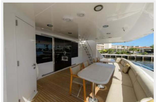
Aft Deck Dining