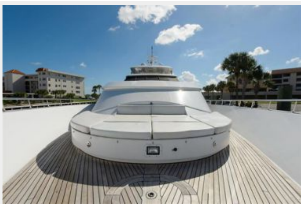
Sunpad on Forward Deck