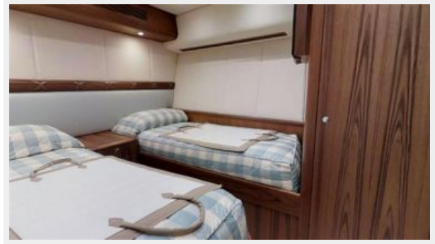
Twin Stateroom Portside