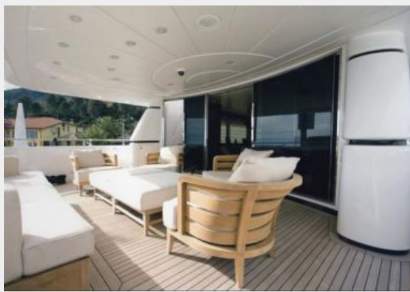
GPS - SAN LORENZO 88' (SL88') - Aft Deck Lounge