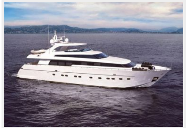
GPS - SAN LORENZO 88' (SL88') (sister-ship)