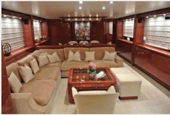
GPS - SAN LORENZO 88' (SL88') -Main Salon