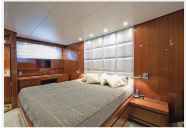
GPS - SAN LORENZO 88' (SL88') - VIP cabin (forward)