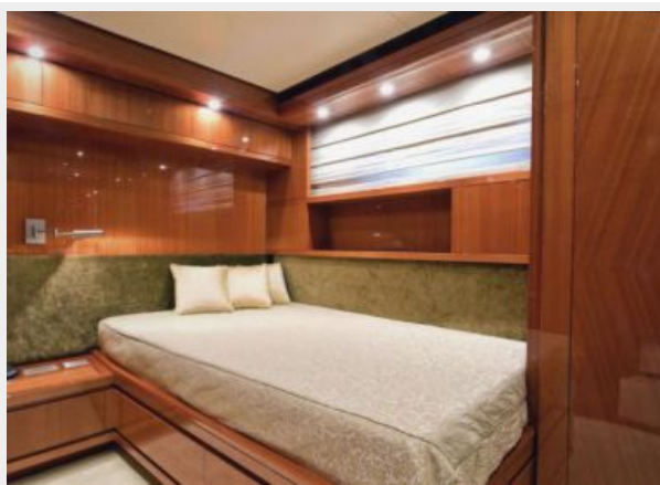
GPS - SAN LORENZO 88' (SL88') - Double Cabin (starboard)