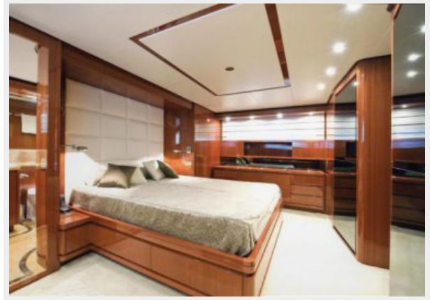
GPS - SAN LORENZO 88' (SL88') - Master Cabin (amidship)