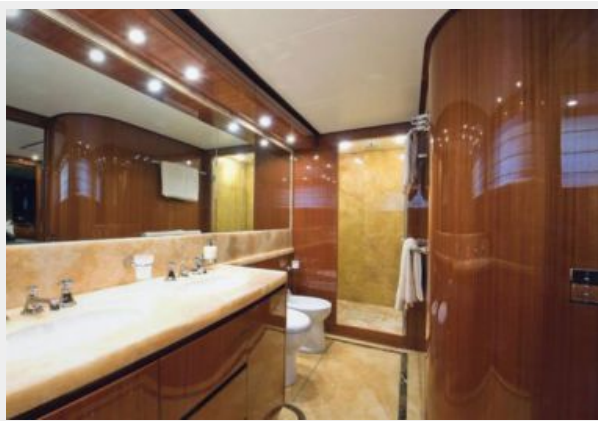
GPS - SAN LORENZO 88' (SL88') - Master Bathroom