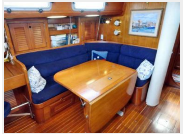
Port Main Salon