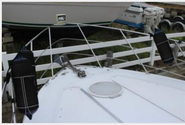
Night Vision Camera 1