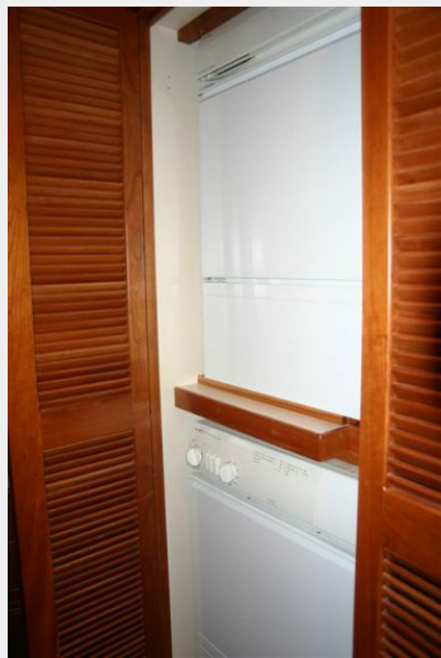
Washer & Dryer