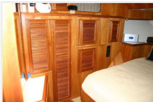
Master Stateroom Port