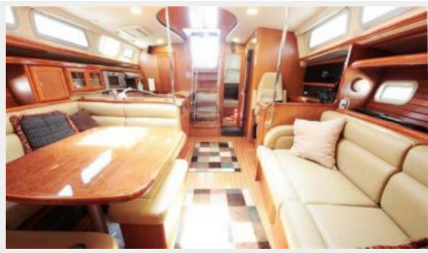
Hunter 49 Main Salon looking Aft