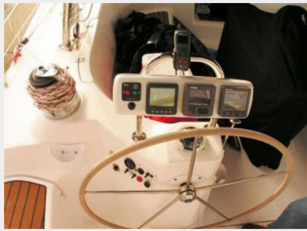
Hunter 49 Port Helm