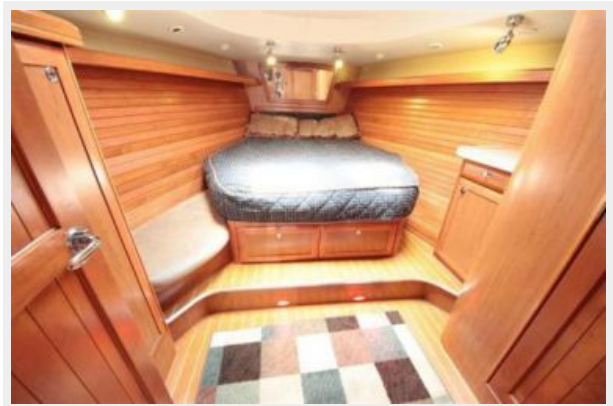
Hunter 49 Owner's Stateroom