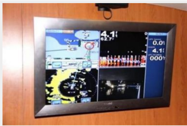
Hunter 49 Main Salon Multi Display TV