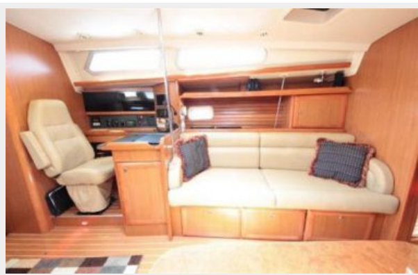
Hunter 49 Main Salon Portside