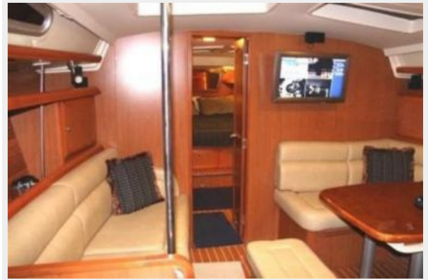
Hunter 49 Main Salon