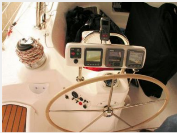
Hunter 49 Port Helm