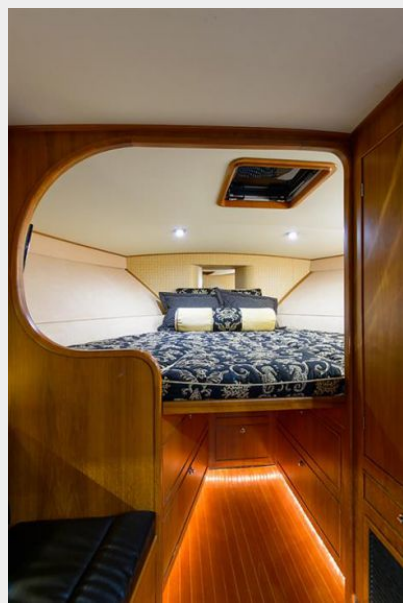
Stateroom Queen Berth