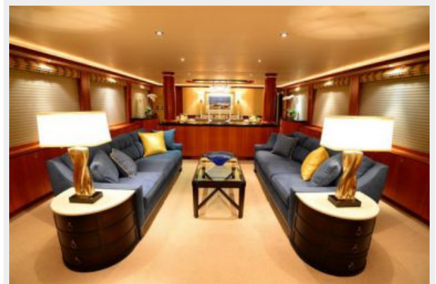
MAIN SALON LOOKING FOWARD