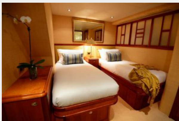
GUEST STATEROOM - TWIN