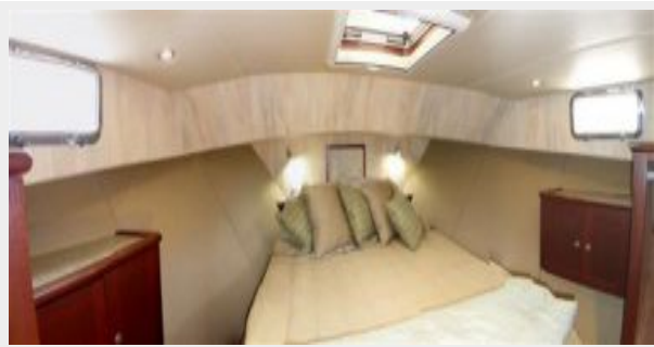
Master wide shot