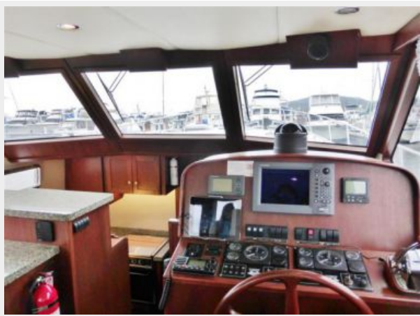
Helm looking to Galley