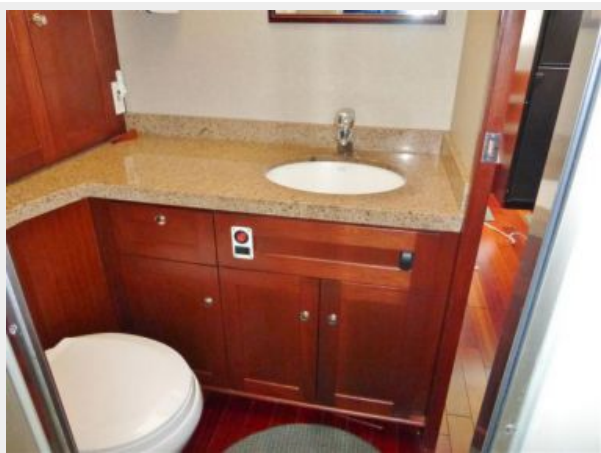
Head looking aft