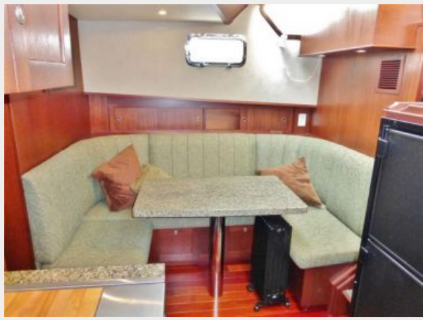
Galley starboard side