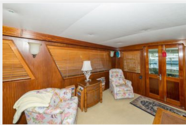
Main Salon Barrel Chairs