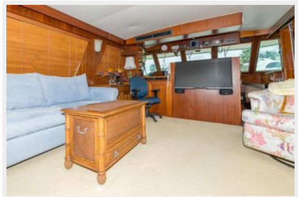
Main Salon Looking Forward