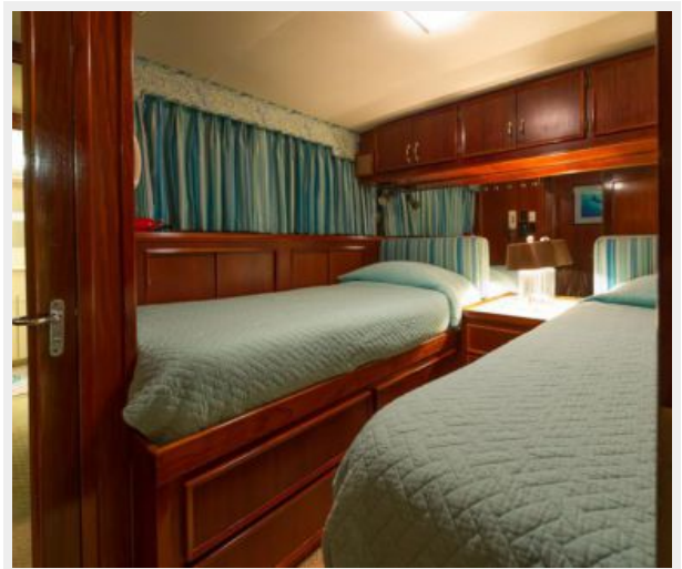
Twin Guest Stateroom