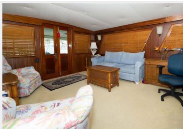
Main Salon Looking Aft