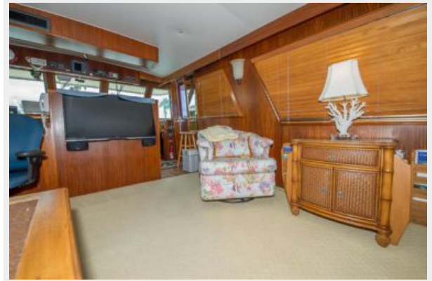
Main Salon Large LED Color TV