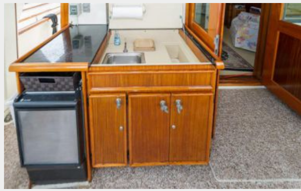
Aft Deck Bar