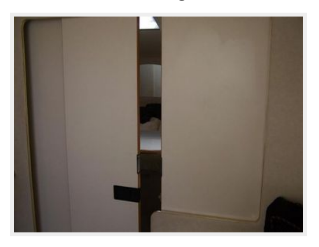
Salon Sliding Door