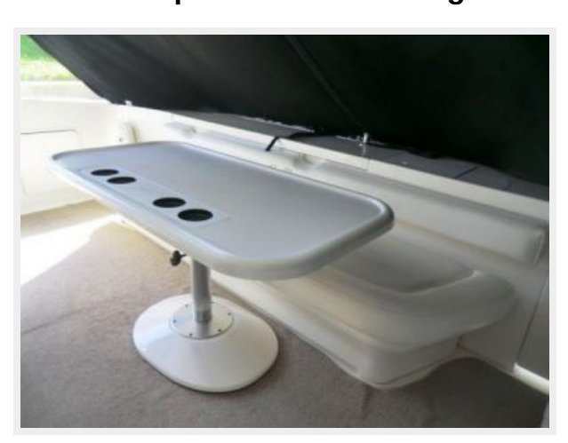
Cockpit Table and Seating