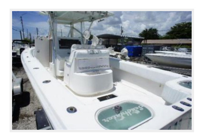
Key West hardtop with abundance of rod holders