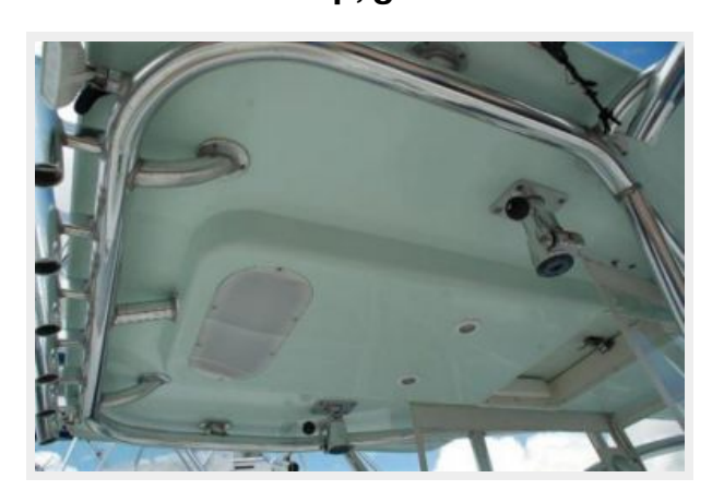
Underside of hardtop, gelcoat matches hull