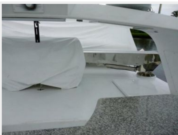
Boat Deck - davit