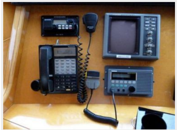
Helm - Port