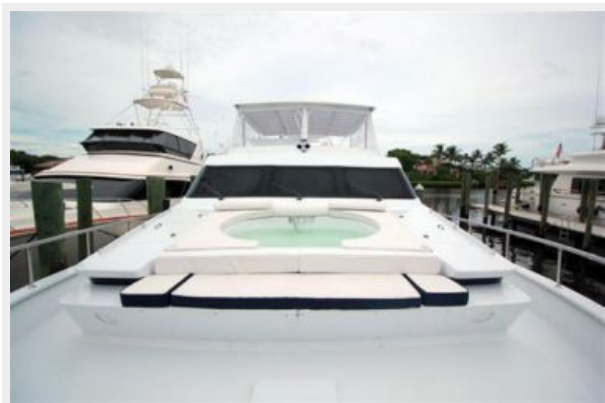
Jacuzzi & Seating on Fore Deck