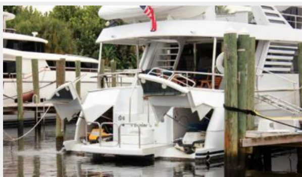
Aft View with Garages open