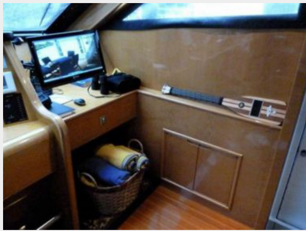
Helm - Desk Console - Starboard