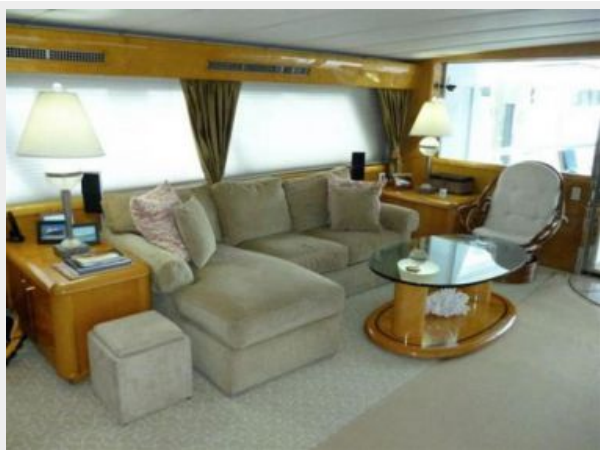
Salon seating Starboard