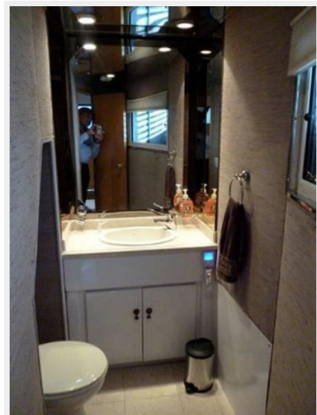
On-Deck Day Head