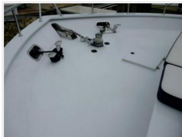
Bow - Anchor & Windlass