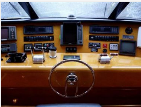
Helm - Center