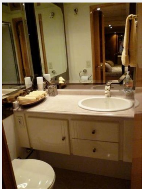
Starboard Guest Bath