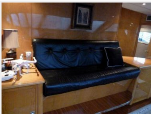
Pilothouse Guest Seating