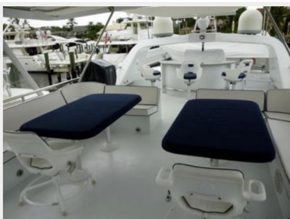
Flybridge looking Aft