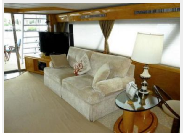
Salon seating Port