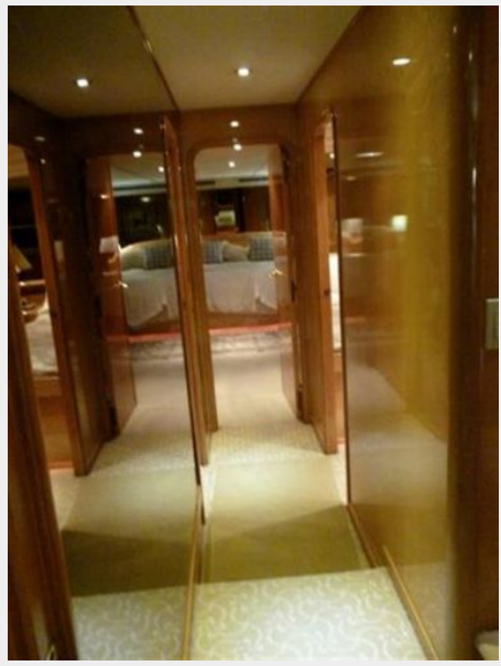
Companionway looking Aft to Master Stateroom