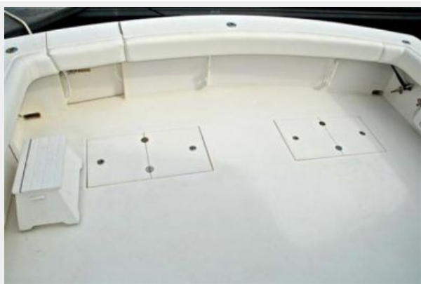
Cockpit View Aft