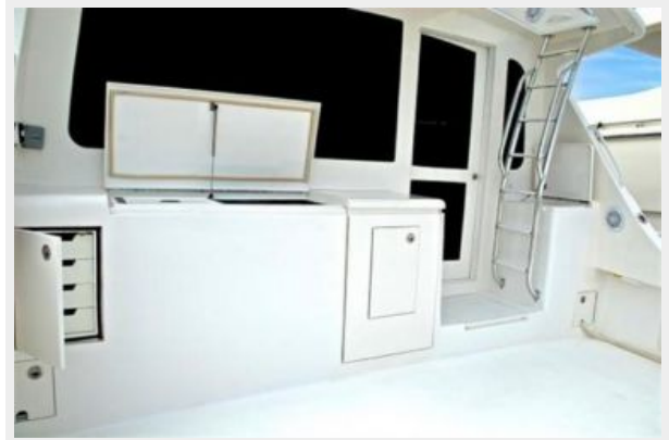
Cockpit Freezer Cabinet