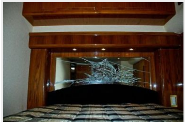
Master Lighted Headboard Mirror