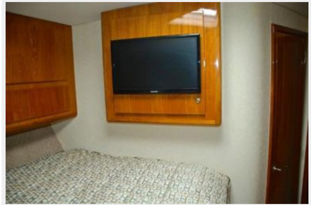
VIP Custom Mount TV