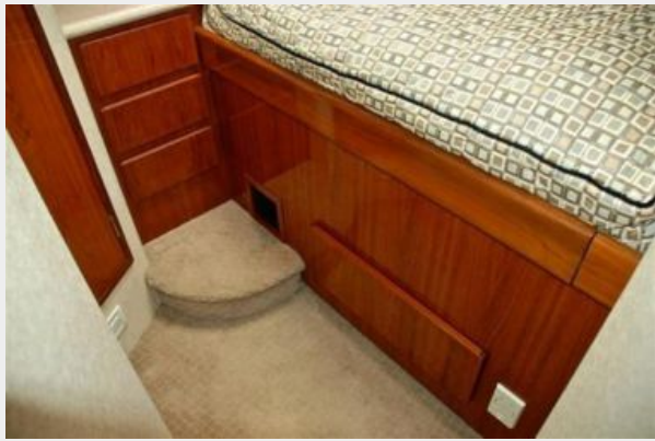
VIP Storage Below Berth