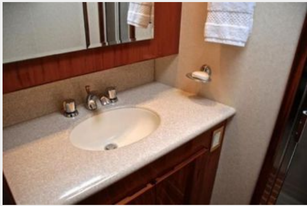
Master Ensuite Head