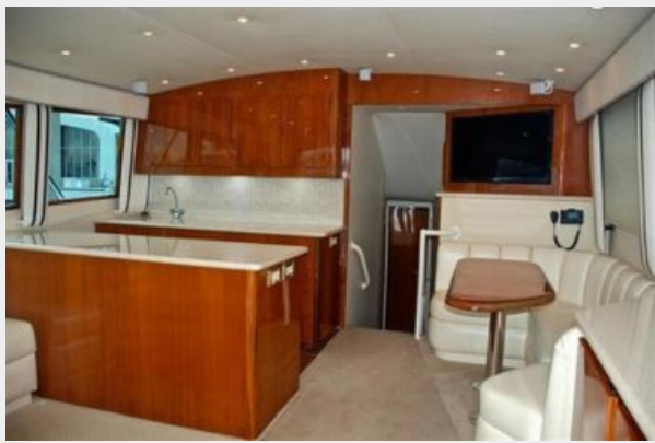
Salon Fwd View