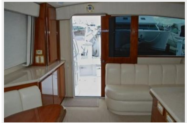
Salon Aft View