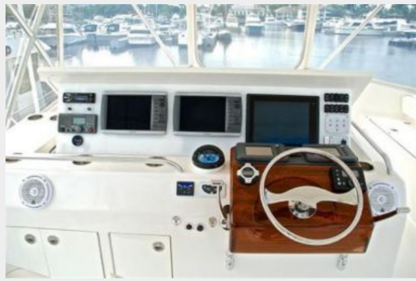
Helm Console Open