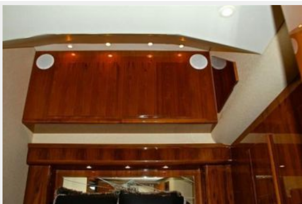
Custom Upper Cabinet Master Berth