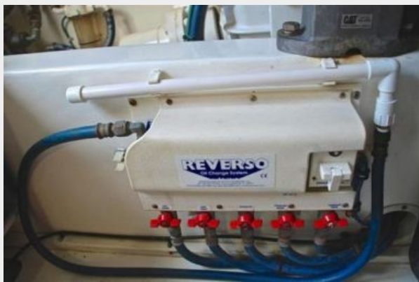
Engine Room Outbound View