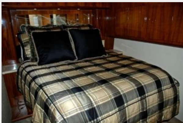
Master Queen Island Berth