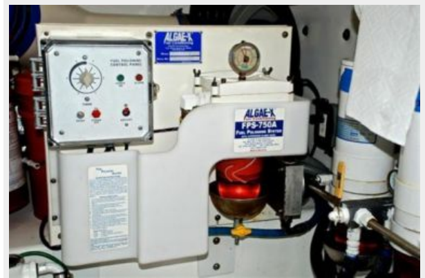
Reverse Oil Change System