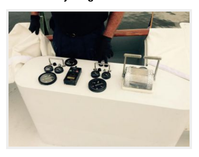
Flybridge Aft Helm