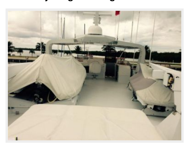
Flybridge looking forward