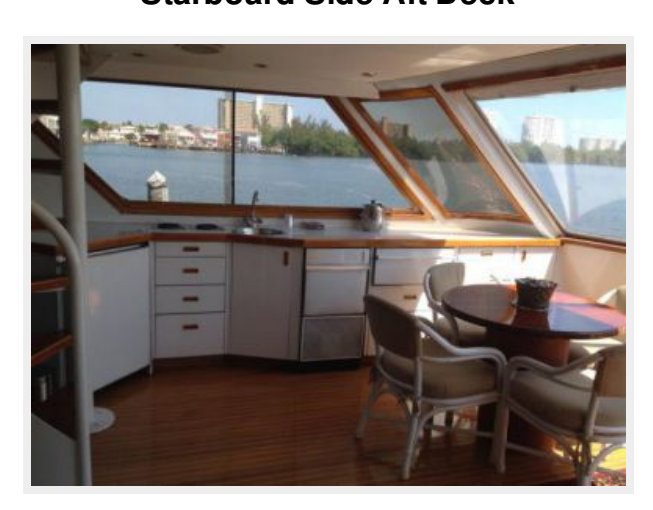
Starboard Side Aft Deck