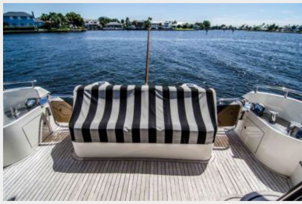
Entrance to Engine Room