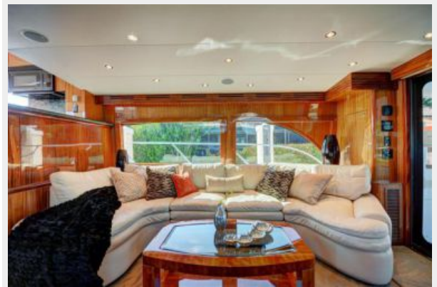
Salon to Starboard