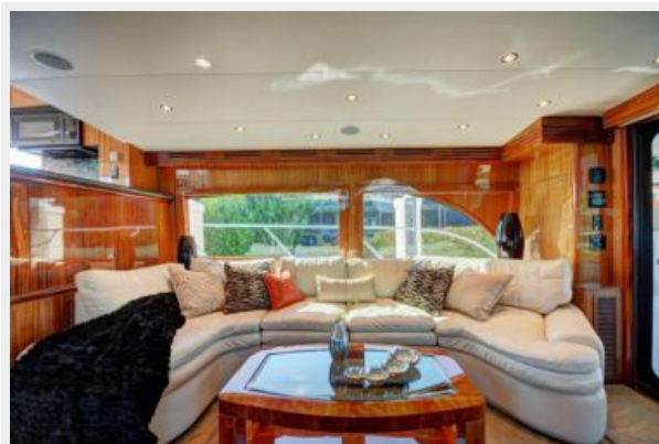
Salon to Starboard