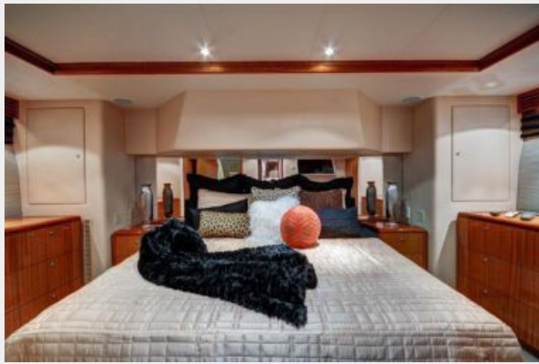
Master Looking Aft