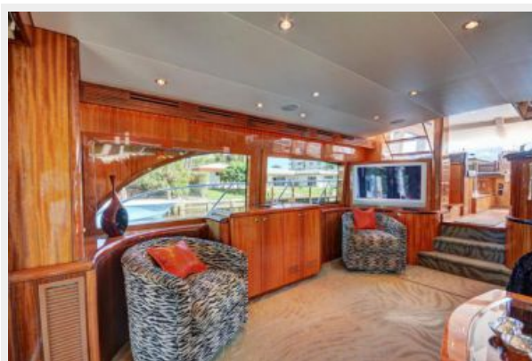
Salon Forward to Port