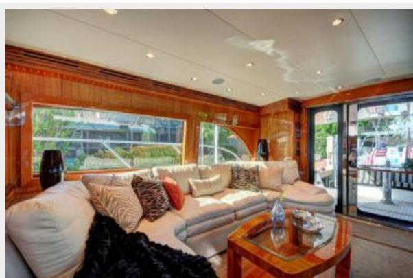
Salon Aft to Starboard