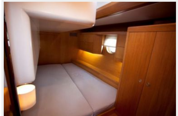
Callista Guest cabin