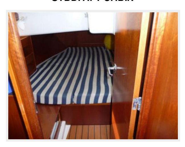
STBD. AFT CABIN