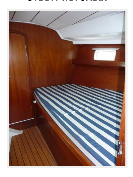
STBD. FWD. CABIN