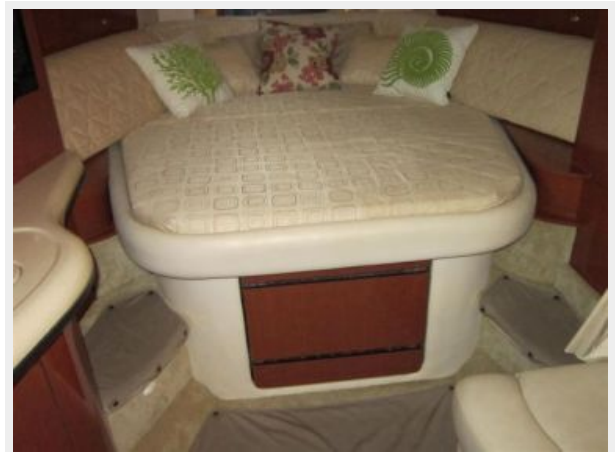
Master SR Bed