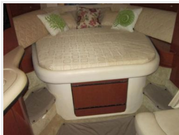
Master SR Bed