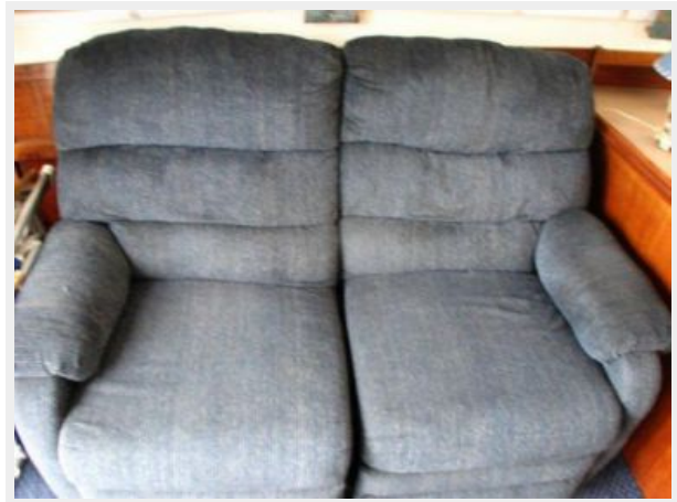
Salon 2 - Sofa