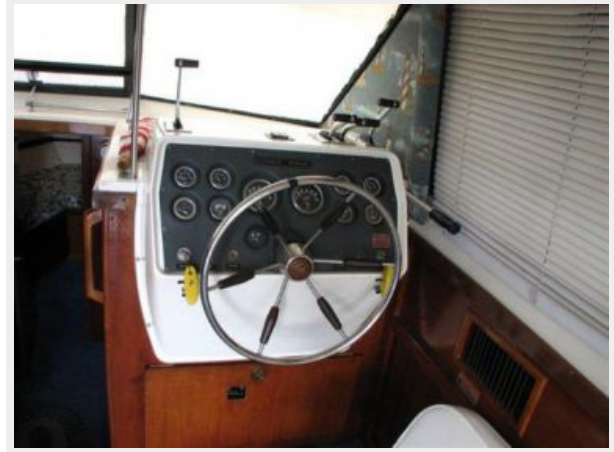
Helm / Electronics & Navigation