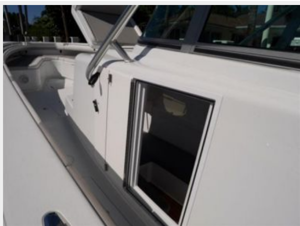
Port Cabin Entrance