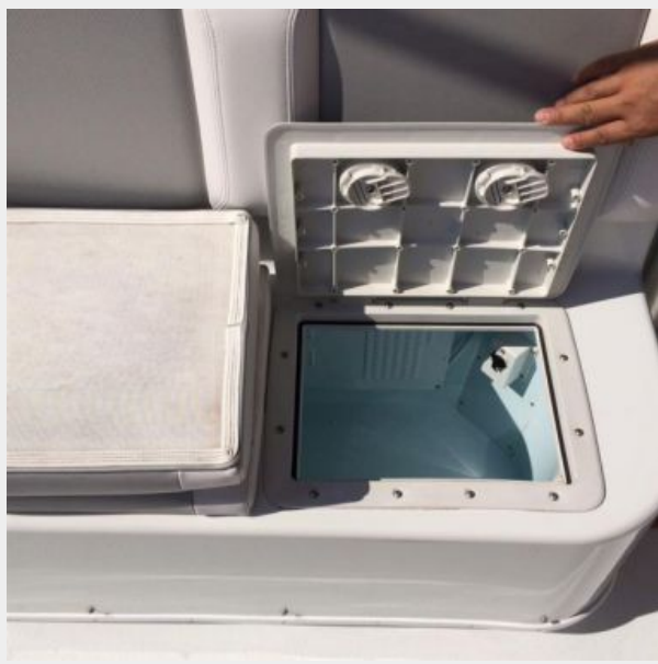
Starboard Aft Refrigerator