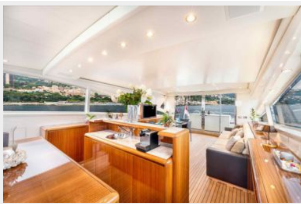
Main Salon & Bar