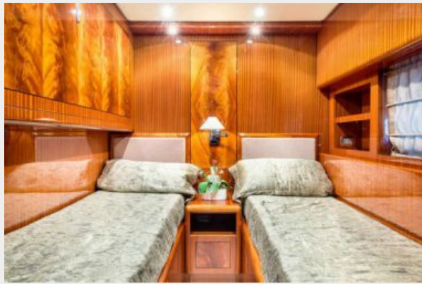
Twin Cabin + Pullman